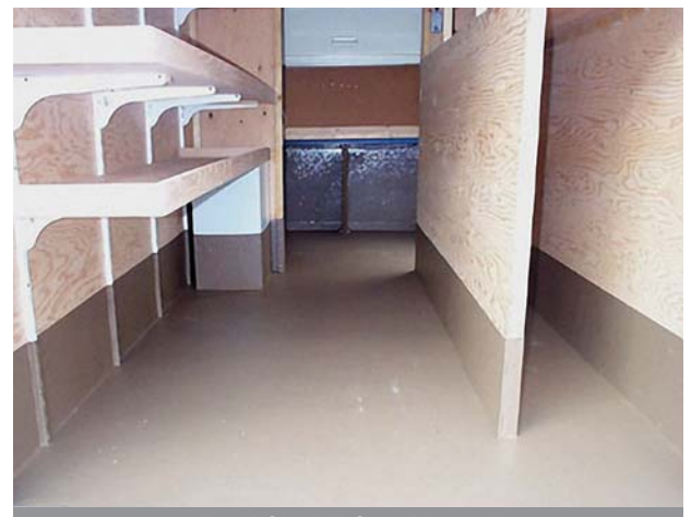
Z-2 IRONLINE Over Plywood