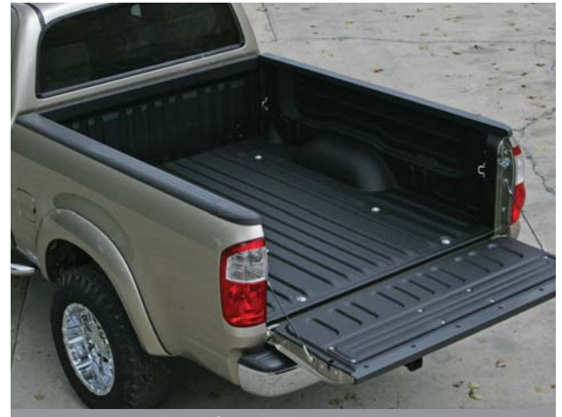
Z-2 IRONLINE Truck Bedliner